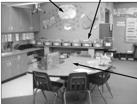
Small group table for guided reading and mini-lessons