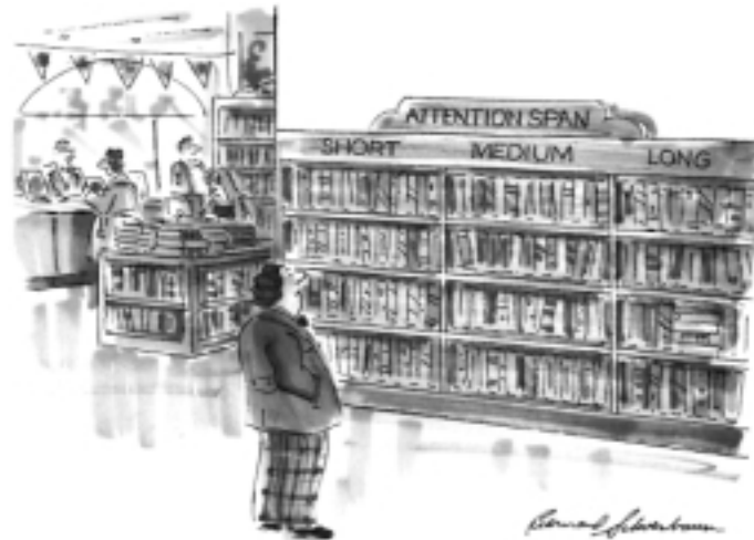
© The New Yorker Collection 1994 Bernard Schoenbaum from cartoonbank.com. All rights reserved.

And now for a more serious take on this important subject.